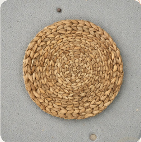
13 $2.35 onwards

A round placemat handwoven from natural water hyacinth. The rich texture and organic pattern bring a warm, artisanal feel to the table.