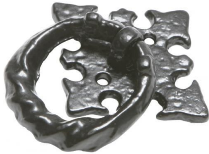
Heritage Cross Ring Pull